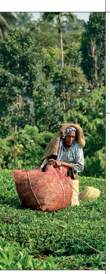
Wayanad, Kerala, India

<sup>e</sup> Benton, Bieg, Harwatt, Pudassaini, and Wellesley. 2021. Food system impacts on biodiversity loss: for food system transformation in support of nature: <u>https://cutt.ly/OmdbX5K</u>